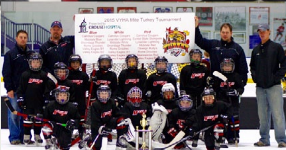
Midstate White took Championship over Camillus Cougars at Turkey Tourney!