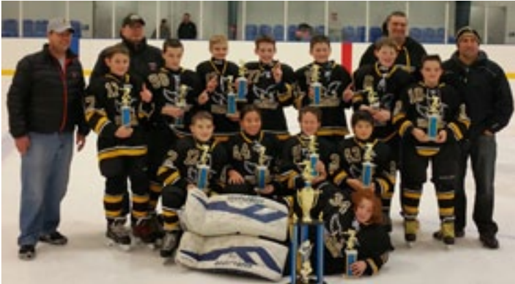
Valley Hockey Pee Wee Minor won the Gene Harrington Classic in Niagara Falls