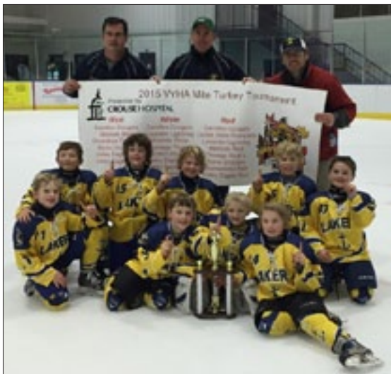
Skaneateles took the Mite Red Championship over Camillus Cougars in the Turkey Tourney.