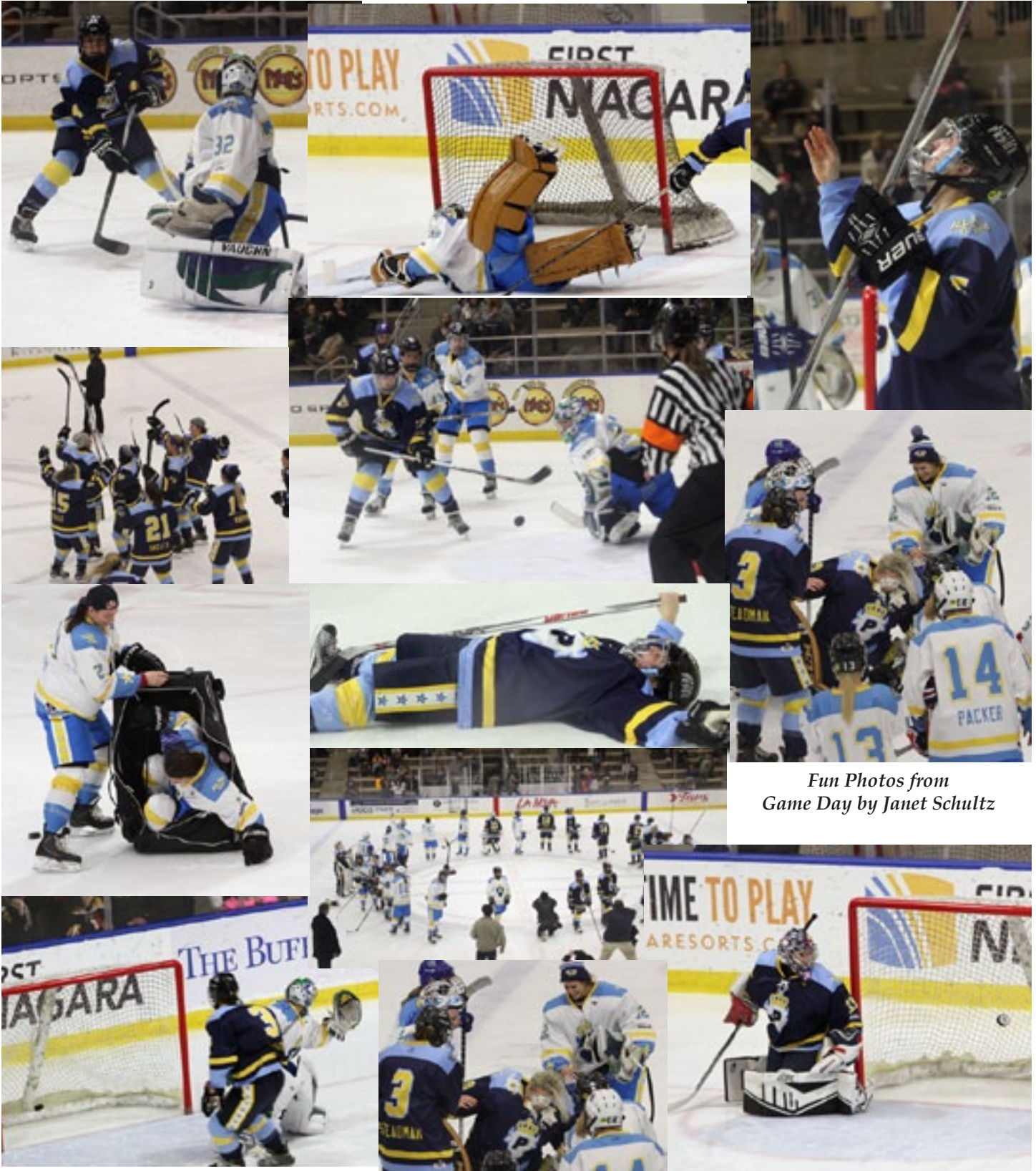
Fun Photos from Game Day

HOWELL MOTORS, INC. "Where Friends Send Friends"