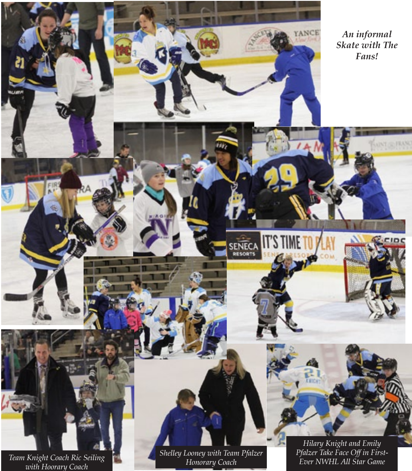
An informal Skate with The Fans!