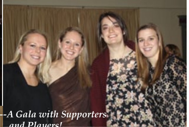
First Up--A Gala with Supporters and Players!