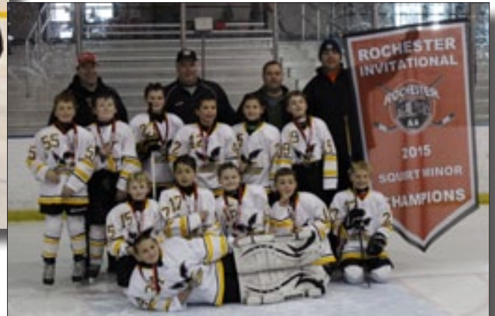
Valley Squirt Minor defeated the Hamburg Hawks to take the Rochester Invitational