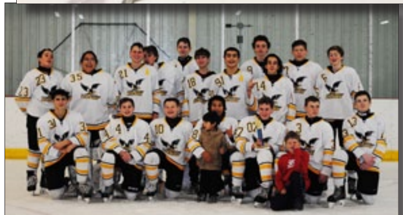
Valley Bantam Travel won the Saratoga Youth Tournament