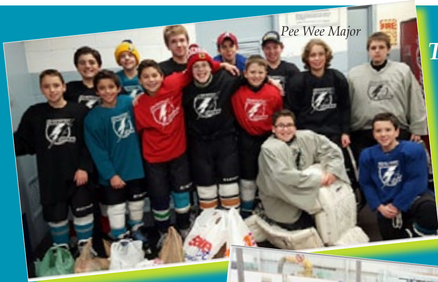
Pee Wee Major

Tonawanda Lightning Are Active On The Ice AND in Their Community!