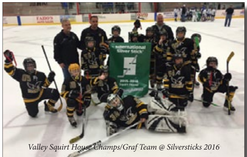
Valley Squirt House Champs/Graf Team @ Silversticks 2016