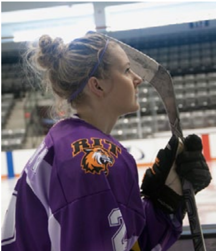
(RIT DIFD Continued from Page 11)

“The DIFD organization certainly hits close to home within the hockey community. We are hopeful to spread the positive message throughout the Rochester community.